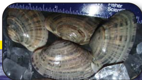
Sunrays on ice.

The sunray venus clam, Macrocallista nimbosa , is a large attractive clam distributed from South Carolina to Florida and the Gulf states. From 1967 to 1972, two million pounds of these clams were harvested in the panhandle region of Florida. However, insufficient natural stocks of sunray venus clams, as well as the small size of fishing grounds, limited the development of the natural fishery. This prior fishery, market and potential growth rate, along with being a native species, makes the sunray venus clam a logical choice as a new candidate species to expand the modern Florida cultured hard clam industry.