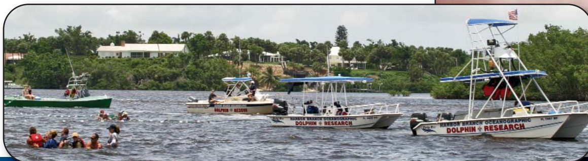
It takes a small fleet of boats to cover the 156-mile stretch that is the Indian River Lagoon, home of the dolphins studied by Harbor Branch.