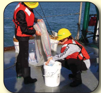
Students emptying the cod-end from the neuston net.