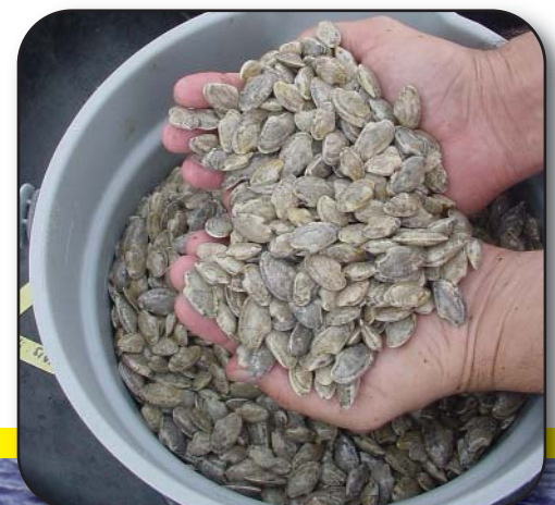
Sunray Venus Clam seed.