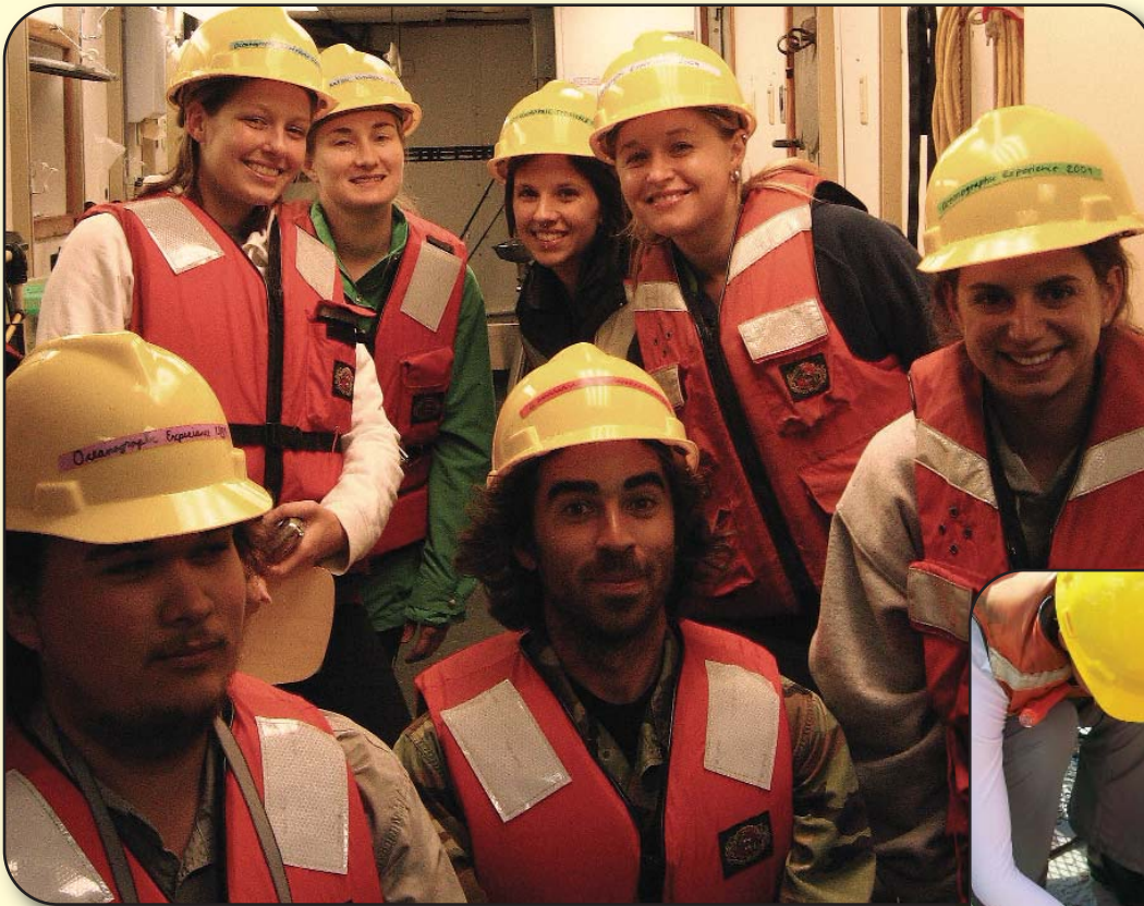
Students on the second leg of the cruise, decked out and ready to go work on the stern.