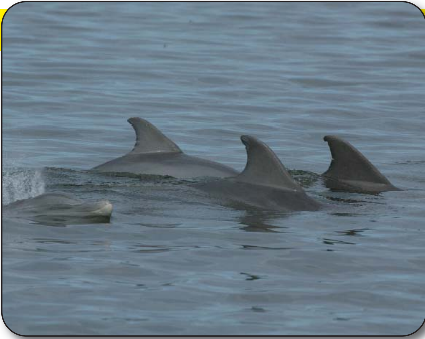
Three out of four. This picture captures the dorsal fins of three of four dolphins swimming together. Individuals are identified by the distinctive marks of their dorsal fins.