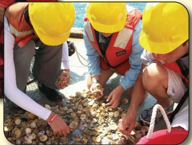
Students sorting through Capetown dredge sample.