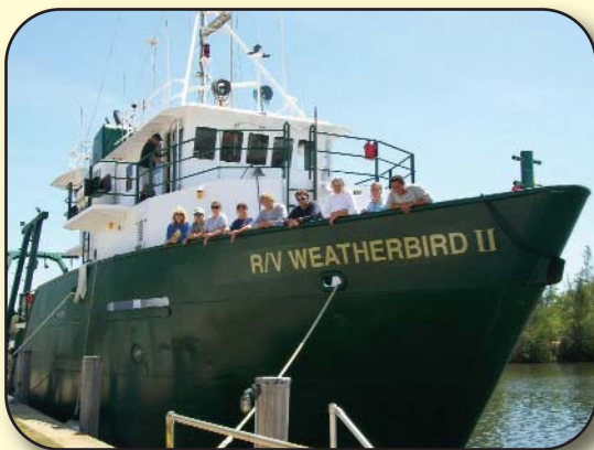
Students on the first leg of the cruise, standing on the bow of the Weatherbird II shortly before departure.

Fourteen students in Oceanographic Experience for Undergraduates , a new course in the “Semester by the Sea” program at Harbor Branch Oceanographic Institute at Florida Atlantic University, recently wet their feet on a research cruise on the RV Weatherbird II .