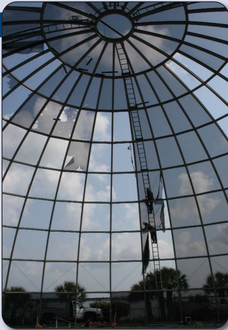
The Johnson residence pool will once again be used to rehabilitate, strengthen and prepare wild dolphins for release back into their natural habitat.