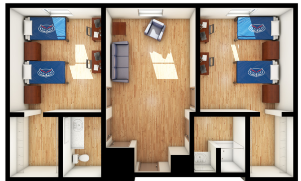
SHARED DOUBLE SUITE